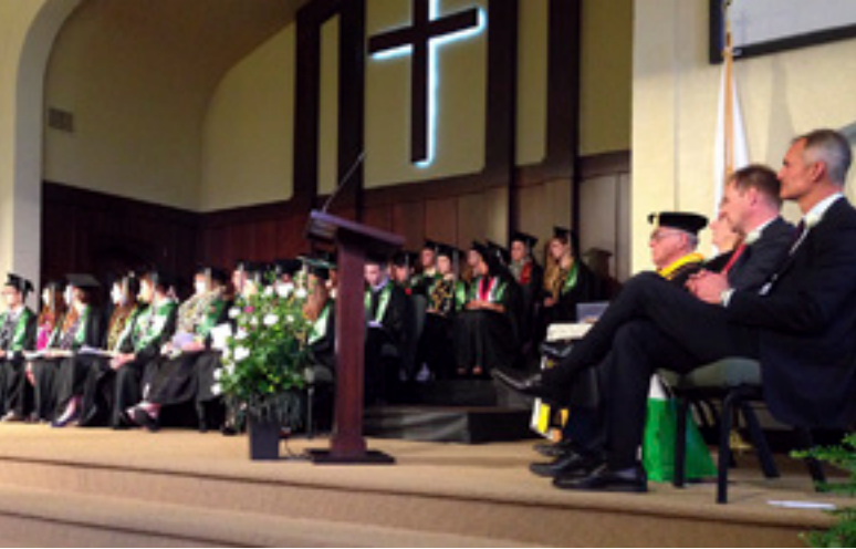
The weekend of June 6 was filled with activities culminating the high school careers of 31 students at Columbia Adventist Academy.