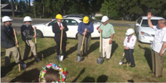
The Russian-Ukrainian Parousia Church celebrates the groundbreaking of what is believed to be the first Russian-built Adventist church in the United States.