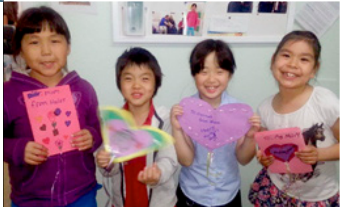
The remote company of believers in Bethel represents eight different cultures, which uniquely positions members to reach the diverse communities in their area.

Ken Crawford, Alaska Conference president