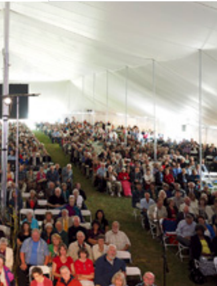
A full tent on Sabbath holds 2,000 guests.