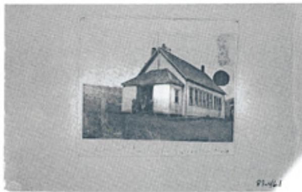
The school/church in Advent Gulch.

concentration of Adventist children in the conference. They decided the gulch was too remote and small for an