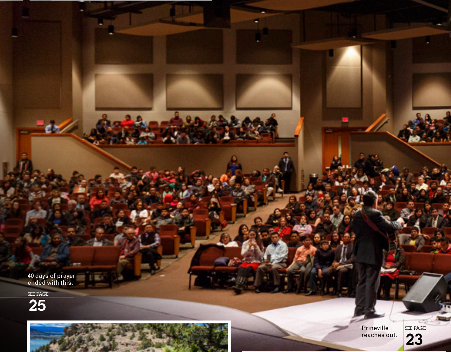
40 days of prayer ended with this.