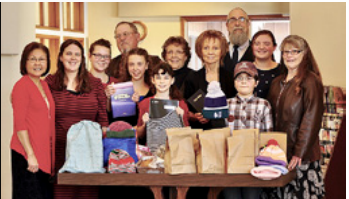
The Prineville Friendship Meals team provides food to the homeless and needy two Sundays each month.