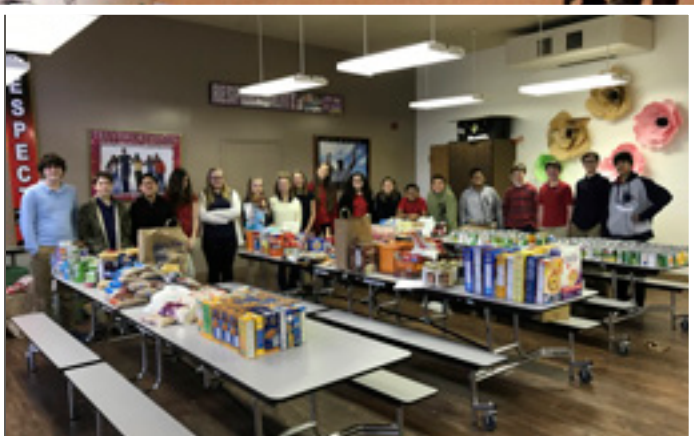
Kirkland fosters foster families.