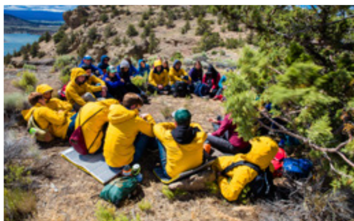
Ministering to tomorrow's leaders.