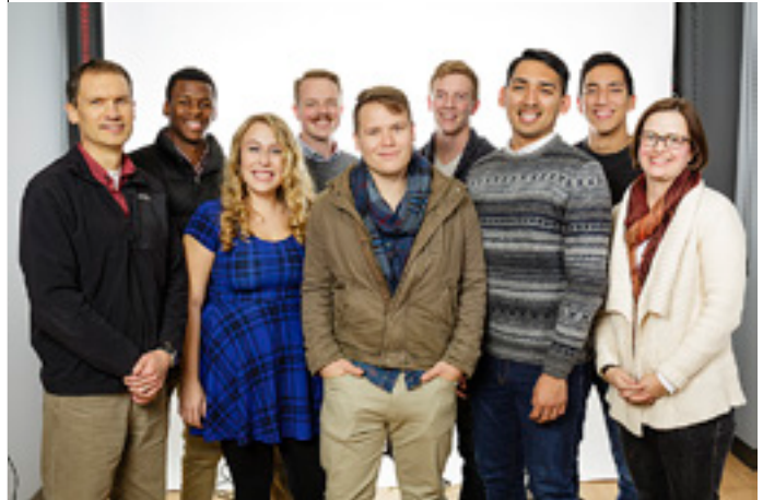
Senior officers for the College Place campus.