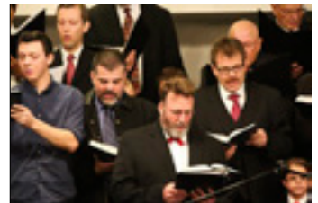
The congregational men's chorus adds their voices to the Hayden Lake Church Christmas program.