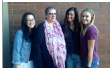
Senior officers for the Portland campus.

Ore.), health science major, spiritual vice president.