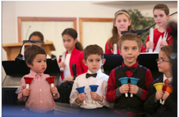
Kids enjoy ringing bells of many colors.