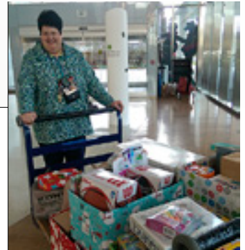
The funds raised by students provide Christmas surprises for kids at Randall Children’s Hospital.

At the end of the project, each student gave a presentation to their class about what they did and how much they earned after buying the Band-